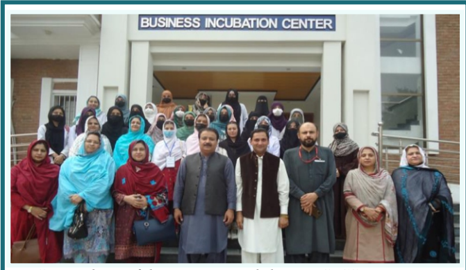
Group photo of the training workshop on SPSS at Business Incubation Centre-University of Peshawar.

CECOSE University Peshawar, benefited from hands-on training.