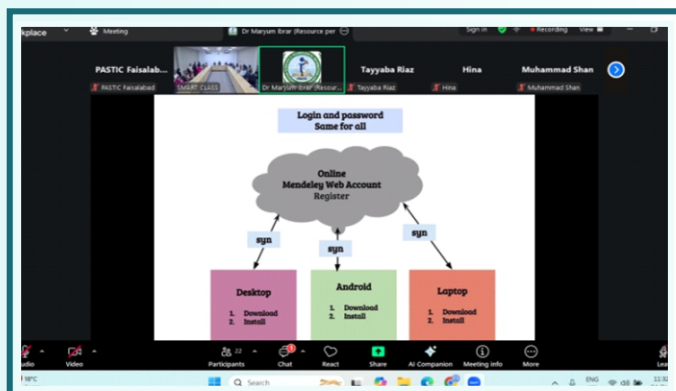
A Glimpse of the webinar at CUVAS showing presentation slide