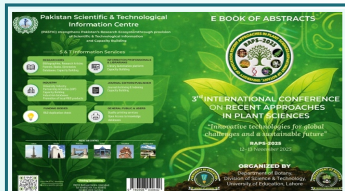
E-Abstract Book of 3 rd International Conference on Recent Advances in Plant Sciences published by PASTIC (cover page)

PASTIC collaborated with the Department of Botany, University of Education, Lahore to support the conference on "Recent Approaches in Plant Sciences" held on November 12, 2025, by publishing the e-Abstract Book of proceedings.